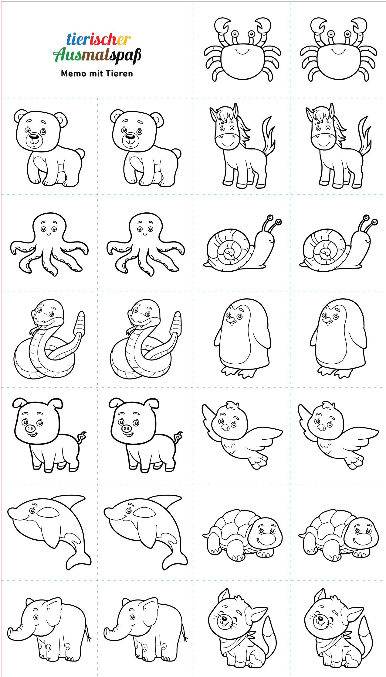
front (individual motif)